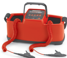
NaviTrack Transmitter 10 Watt